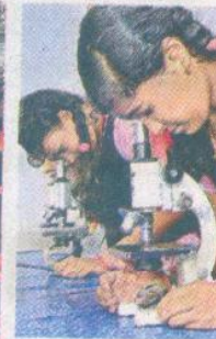
Students during the training in basic science as part of the Inculcate 2012 programme in CUSAT, Kochi. Sixty students from across the state took part in the programme.